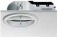
AN03.3420 .30 WHITE

Recessed shallow depth downlight, with prismatic diffuser, integral control gear