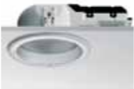
AN03.3422 .30 WHITE

Recessed shallow depth downlight, with prismatic diffuser, integral control gear